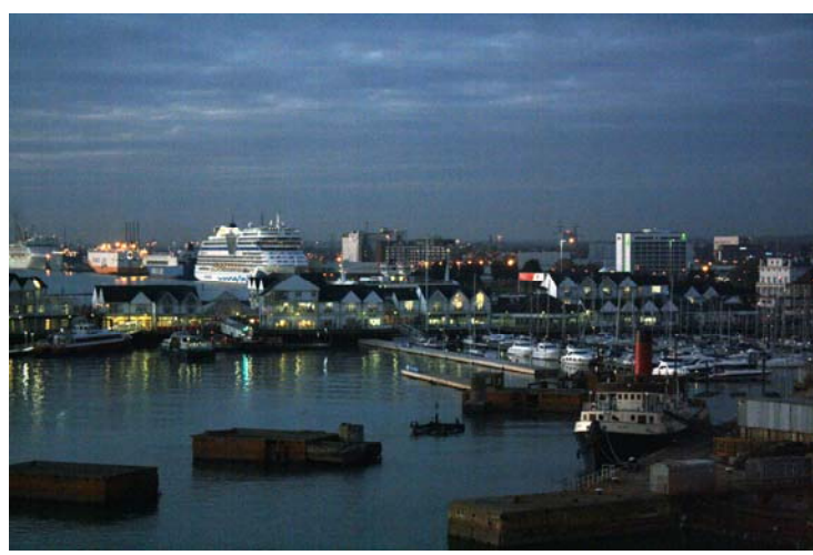
Southampton with Queen Victoria also in harbor. Taken from deck of QM2

11/26 We were in Southampton today for the first of what will be four visits on this trip. We got a lot done but it was frustrating. So we went out to catch the shuttle into the city's heart.