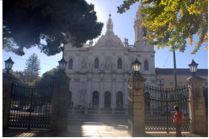
Cathedral—the bus stop behind was the site of the attempted robbery.

THEN, the bus driver reaches out, pulls me on board and then grabs into the crowd, returning with my thief's' wallet in his hand. Someone had went for it. That wallet is an old one