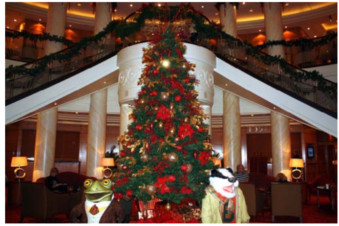
QM2 decorates for Christmas

11/29 We had planned to go to Paris today but it's cloudy and rainy. However, the deciding factor was that the ship was now leaving at 7:30 instead of 9:30 as planned. That made the trip possible but ate up any margin for error. We also got up at 7:45, 45 minutes before. Instead