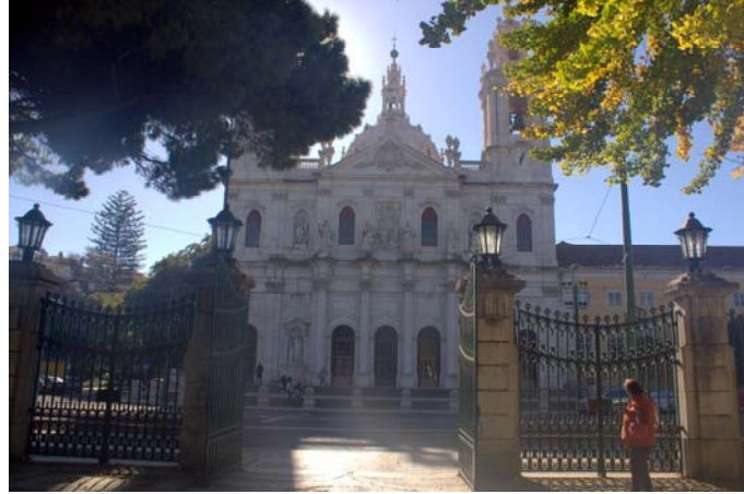
Cathedral—the bus stop behind was the site of the attempted robbery.

THEN, the bus driver reaches out, pulls me on board and then grabs into the crowd, returning with my thief's wallet in his hand. Someone had went for it. That wallet is an old one with a few dollars in it and some old invalid credit cards. It's primarily for a robbery with violence so I can either get the guy to go away or distract him enough clobber him (less likely as I age).