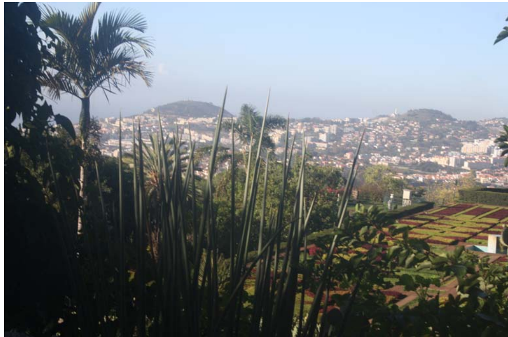
City Center of Funchal from the Botanical Gardens

There was a bit of confusion at the end. We had thought the driver said 17 Euros. Midway through the drive, I was wondering as it seemed we were burning more than that in fuel.