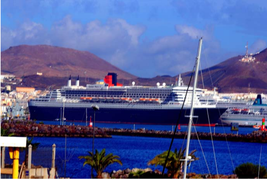
QM2 at Gran Canaria

12/6 At the stop at Las Palmas, Gran Canaria, we decided to stick to the town. We took one of those hop-on hop-off bus tours. It was a national holiday so shopping was impossible anyway. We got off at several points and made the loop twice because the automated sound-track was a bit erratic.