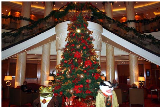
QM2 decorates for Christmas

11/29 We had planned to go to Paris today but it's cloudy and rainy. However, the deciding factor was that the ship was now leaving at 7:30 instead of 9:30 as planned. That made the trip possible but ate up any margin for error. We also got up at 7:45, 45 minutes before. Instead we went back to bed and didn't get up until 10.