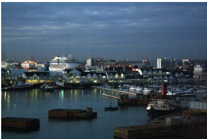
Southampton with Queen Victoria also in harbor. Taken from deck of QM2

11/26 We were in Southampton today for the first of what will be four visits on this trip. We got a lot done but it was frustrating. So we went out to catch the shuttle into the city's heart.