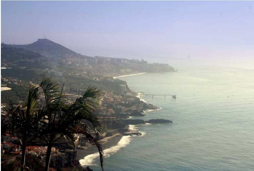
Funchal from the Volcano peak

It was 70! Fortunately, the guy trusted me enough so I could go aboard to get more money exchanged. Equally fortunately, security there was almost non-existent.