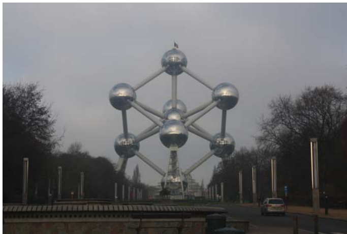
Atomium from the 1958 World Fair in Brussels

12/12 If this is Tuesday it must be Belgium, well it was Thursday, it was Belgium and we decided to do the Christmas markets in Brussels. It was a bus tour that did the highlights of Brussels with free time in