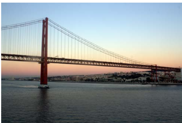
Bridge over river to Lisbon. It is modeled after and by the same architect as the Golden Gate Bridge

We also saw the Castle of St George. It was a bit of a hike but it was worth the pain later. Here is a view of Lisbon taken from the tram stop for Castle of St George.